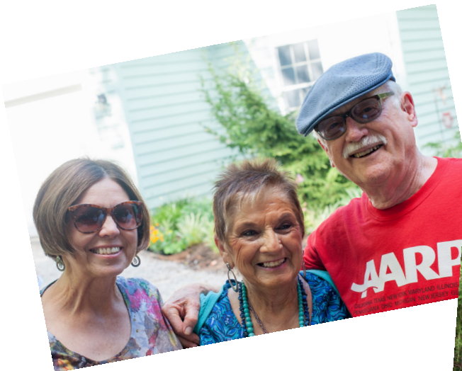
Blacksburg Chapter members at the 2016 summer picnic.