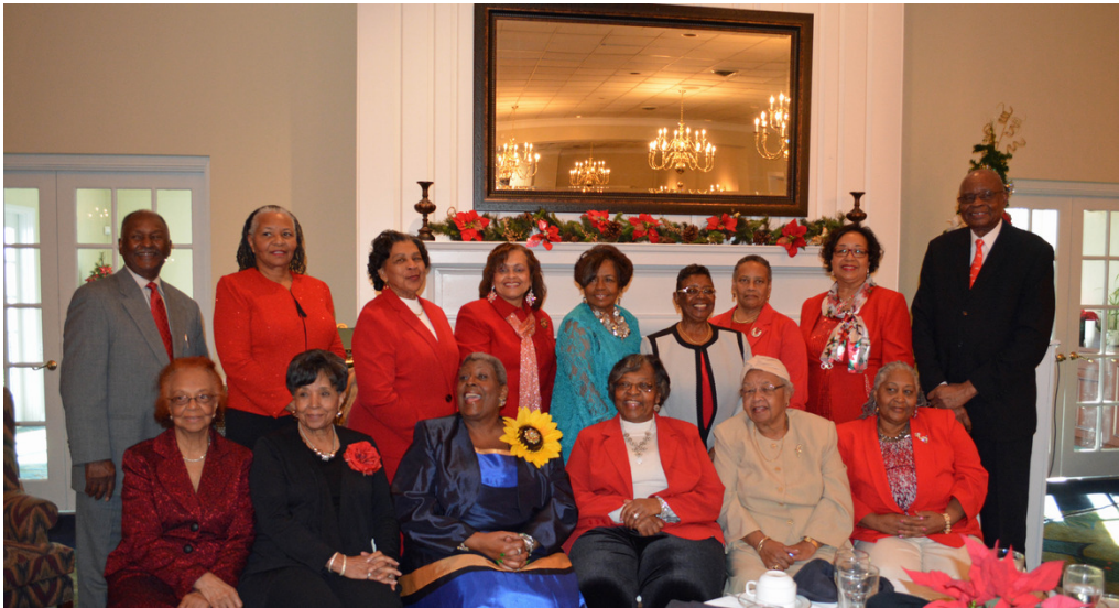
Richmond North Chapter Executive Board