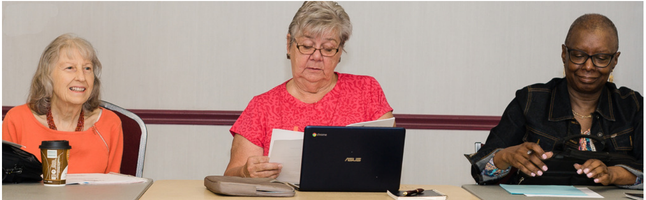
Blacksburg Chapter Board Members at work.